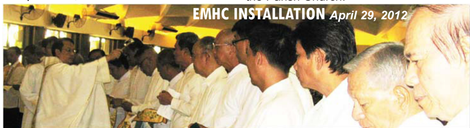
EMHC INSTALLATION April 29, 2012

The Summer Photo Workshop will culminate with a Photo Exhibit on May 26 to June 1 and is part of the "SJBP- So Alive@35" yearlong run-up to the 35th anniversary of the Parish Church.