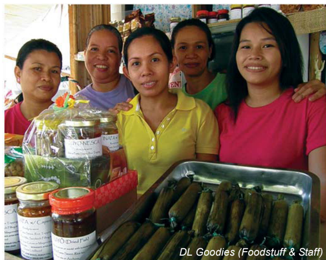
DL Goodies (Foodstuff & Staff)

Last week, I got as a birthday party giveaway, bottles of Tinapa with Capers . Oh my! It is so delicious, and silently demands that you eat it with rice. (Maybe because it is a product of the Divine Livelihood of the Parish of St. John Bosco at Arnaiz St. corner Amorsolo, Makati, tel. 894-5932. Buy lots of bottles, it becomes an instant hit with everyone who tries it!). There must be some special, holy ingredient that goes into it; that or it very simply has God’s