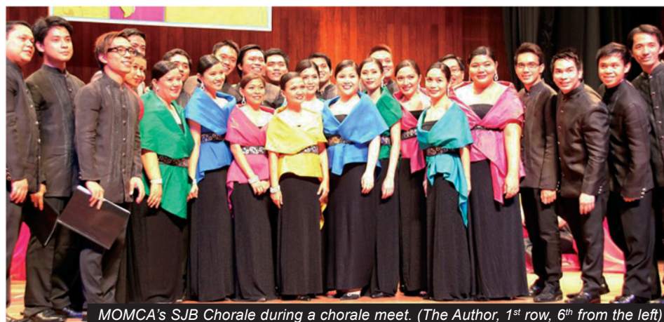
MOMCA's SJB Chorale during a chorale meet. (The Author, 1 st row, 6 th from the left)

Musician-servants require constant training to hone their God-given talents. For this