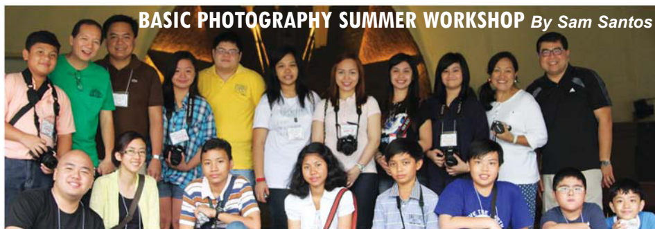
BASIC PHOTOGRAPHY SUMMER WORKSHOP