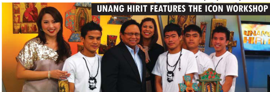
UNANG HIRIT FEATURES THE ICON WORKSHOP