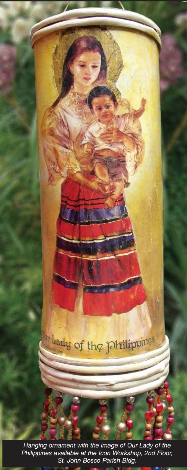
Hanging ornament with the image of Our Lady of the Philippines available at the Icon Workshop, 2nd Floor, St. John Bosco Parish Bldg.

On September 8, exactly nine months after the Solemnity of her Immaculate Conception on the 8 th of December, we shall once again honor one of the most special women ever born – God’s Mother and our Blessed Mother. While this date has been designated and celebrated as the Feast of the Nativity of the BVM since the 8 th century, on the day she was actually born, the heavens and earth must have joined all of creation in a universal dance of jubilation for it was “the day on which the Creator of the world constructed His temple... the day on which by a stupendous project a creature became the preferred dwelling of the Creator” (Saint Andrew of Crete).