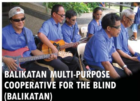
BALIKATAN MULTI-PURPOSE COOPERATIVE FOR THE BLIND (BALIKATAN)