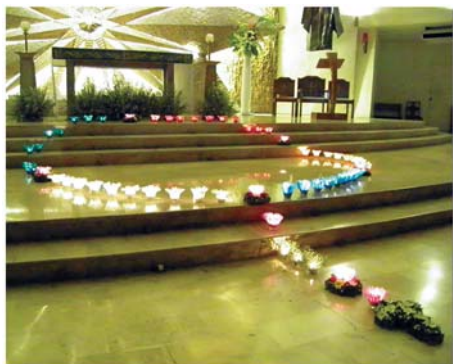
SJBP Legion of Mary organizes Parish Rosary Rally, the culminating activity for the Month of the Rosary – October 29, 2011